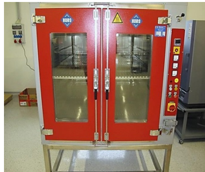
Short circuit equipment, max. current 15 kA / Oven with 1500 l volume