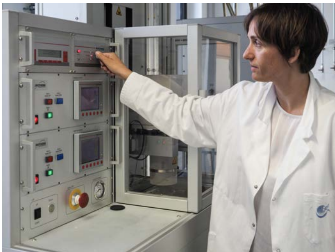
ZSW researcher analyzing the ash produced by incinerating sewage sludge.

Axel Vartmann, PR-Agentur Solar Consulting GmbH, Emmy-Noether-Str. 2, 79110 Freiburg, Germany phone: +49 761 380968-23, vartmann@solar-consulting.de, www.solar-consulting.de