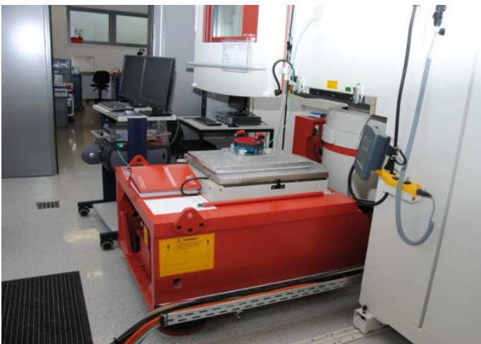
Vibration table with acceleration force of 20 kN, load up to 50 kg, possibility of thermal and electrical superposition