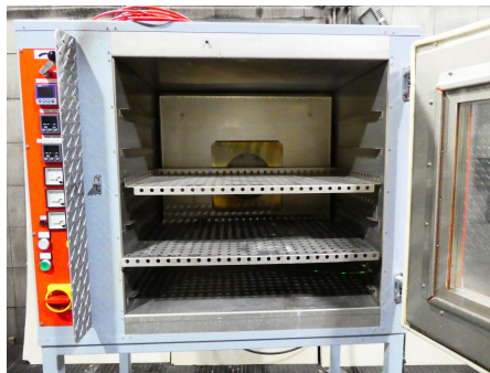
Short circuit equipment, max. current 15 kA / Oven with 200 l volume