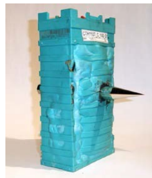
Nail penetration test