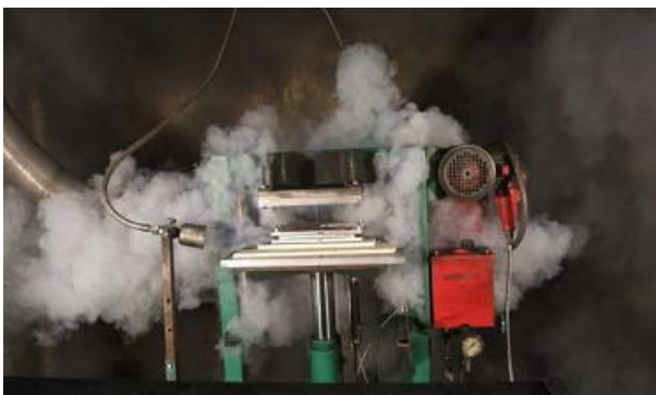
Cell with not controlled dissipation of power

Identification of weakly designed parts of a system